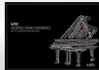
Third World Piano Conference, Novi Sad, June 27 – July 03, 2011