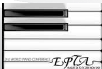
Second World Piano Conference, Novi Sad, August 26 – 31, 2010