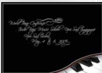
First World Piano Conference, Novi Sad, May 4 – 8, 2009

Over one hundred pianists and piano teachers take part in the World Piano Conference annually, contributing to the further advancement of the standards of teaching and studying piano, addressing all aspects of art, pianism and piano pedagogy, from beginner level to professional, and forming a strong bond between pianists and piano teachers from all over the world. The program of the World Piano Conferences is realised through a variety of forms, including lectures, recitals, master classes, and seminars, encompassing a diverse set of piano pedagogy related topics as well as those focused on the performance of piano literature masterpieces. World Piano Conferences are held annually in the organization of EPTA Vojvodina (European Piano Teachers' Association), and Isidor Bajić Music School. The Fifth World Piano Conference will be held in Novi Sad, from 27 June to 3 July, 2013.